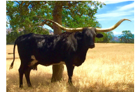
TOUCHDOWN OF RM