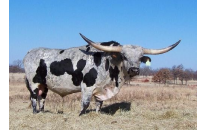
NIGHT SAFARI BL833